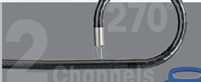
Two Independent Channels