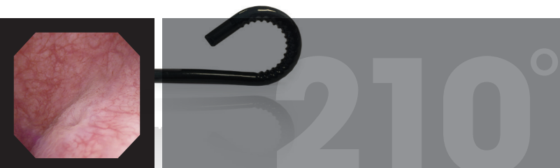
Sensor Cystoscope Picture